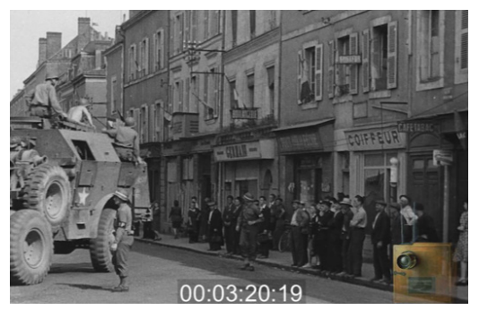
American troops freeing a French town

Other strange things happened, such as the town crier reeling off indiscriminately orders from the American and German commanders